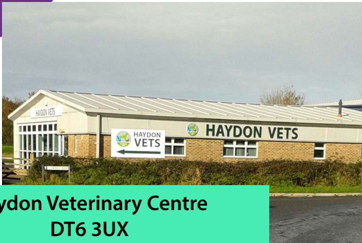
Haydon Veterinary Centre DT6 3UX