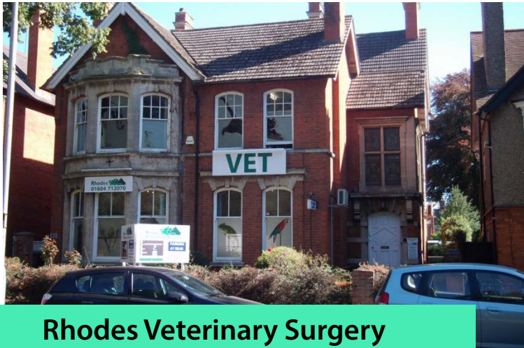
Rhodes Veterinary Surgery Northampton