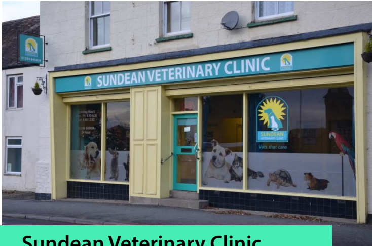
Sundeane Veterinary Clinic Gloucester