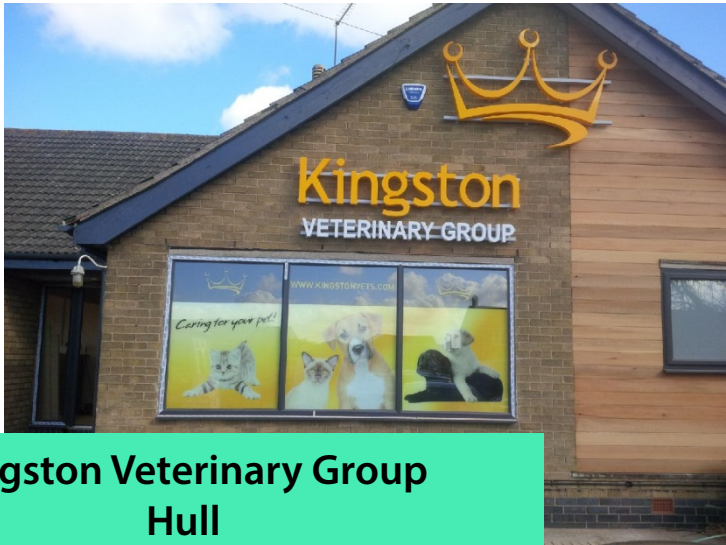
Kingston Veterinary Group Hull